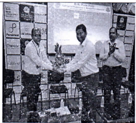
PIC2: FELICITATION OF GUEST DATED ON 28-04-2022