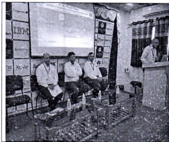
PIC1: INTRODUCTION OF PROGRAM DATED ON 28-04-2022