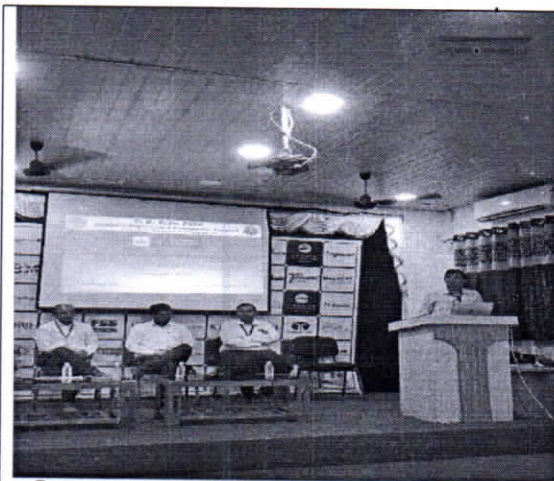
PIC 3: ADDRESSING AUDIENCE DATED ON 28-04-2022